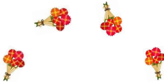
Passing the torch (bouquet)